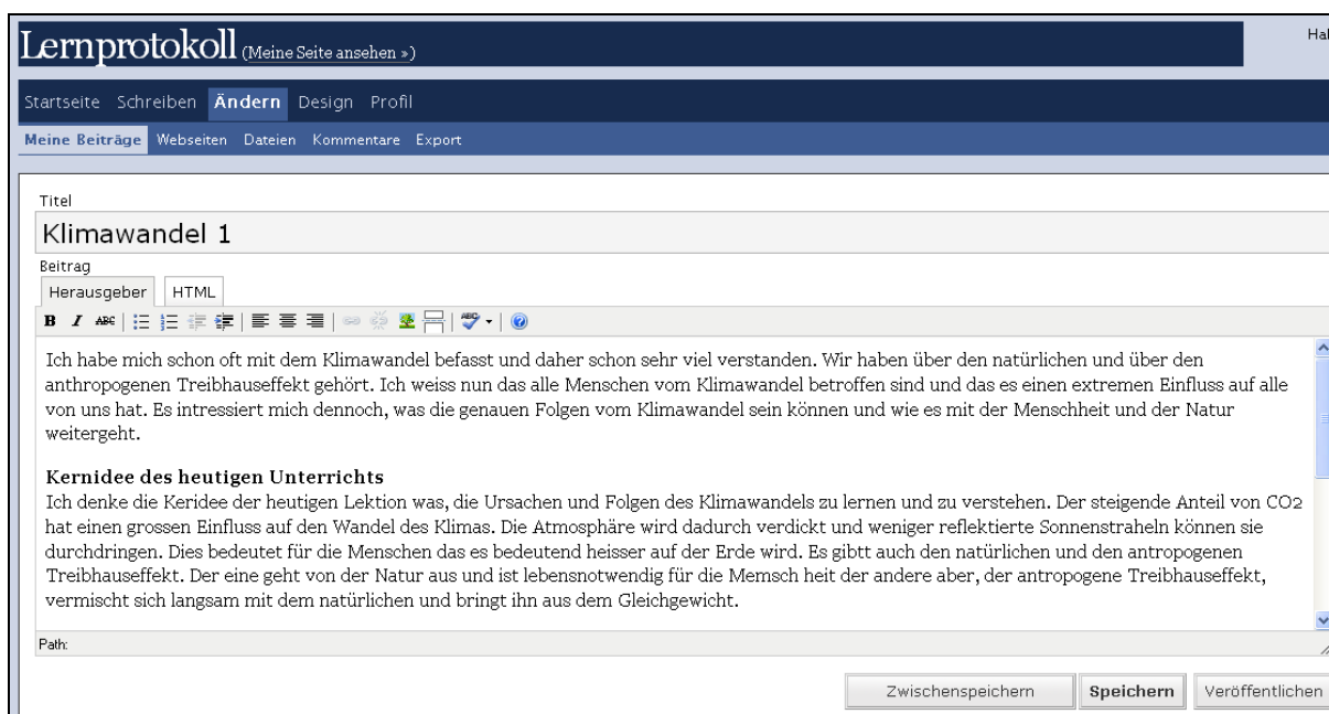
Figure 2. Screenshot of the student weblog writing interface (in German)

The assignment of classes to the study or control group was randomized. A complete randomization at the individual level was not possible within the organizational limits of this field experiment.